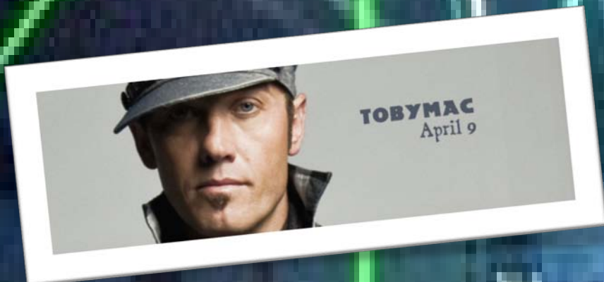
TOBYMAC April 9